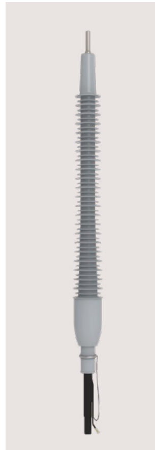
ESF 52 - 170 kV